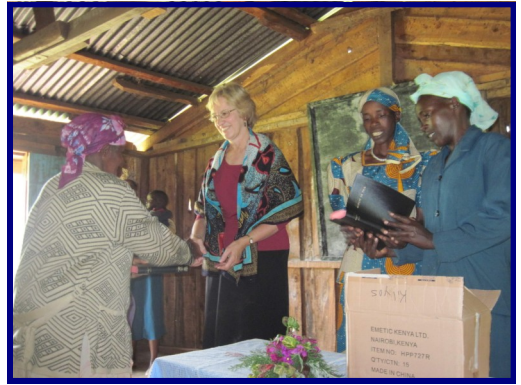
Handing out Bibles to study members

They explained, "We have never been united in our village before. We are learning to love our enemies. We want to stay together. The Spirit of God is moving in our midst and we are so thankful for the Word of God. We thought we knew something. We were learning the Bible verses and hearing the lessons each week. But now that we have our own Bibles, we are learning things we never knew possible." Praise the Lord! Keep praying for each woman who earns her free Bible.