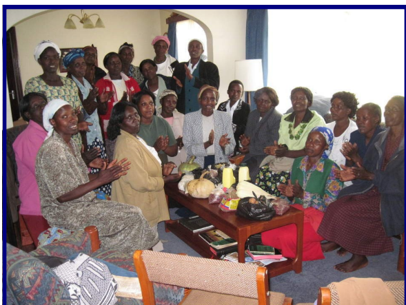
Tabitha leaders from Silibwet say “pole” (sorry).