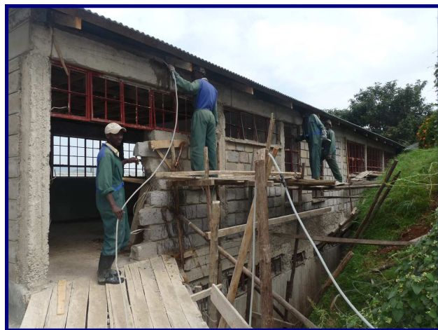
Workmen finish rear side of the two story building.