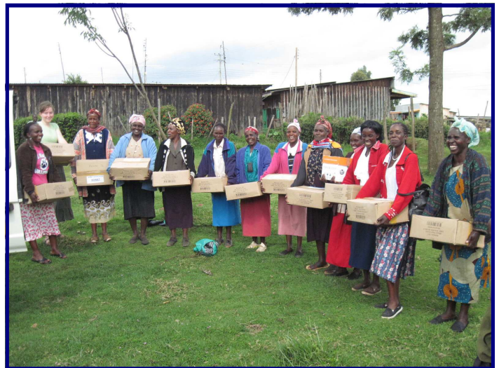
Happy leaders receiving 300 Bibles in one of our more distant areas of studies. Some of the women had been waiting for two years for Bibles.

We are amazed at all God is doing in the women's work – new studies have begun, hundreds of Bibles distributed, house and gift cow projects with local churches to needy families continue. God's Word is touching peoples' lives. See http://tabithakenya.blogspot.com for a recent posting and current prayer requests.