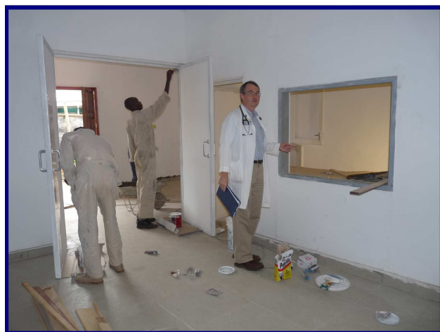
Finishing touches on the CT room and window to control room.